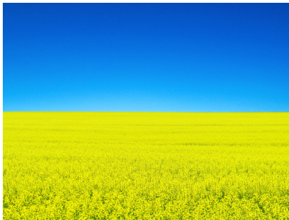
War and Peace by Linda: Taken in 2009 in Prince Edward Island, Canada; post-processed and published in 2022.

What are the backstories behind the creation of a unique collection of maxicards that demonstrates global support for Ukraine? Read on to find out!