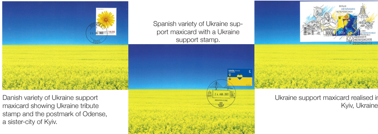
Danish variety of Ukraine support maxicard showing Ukraine tribute stamp and the postmark of Odense, a sister-city of Kyiv.