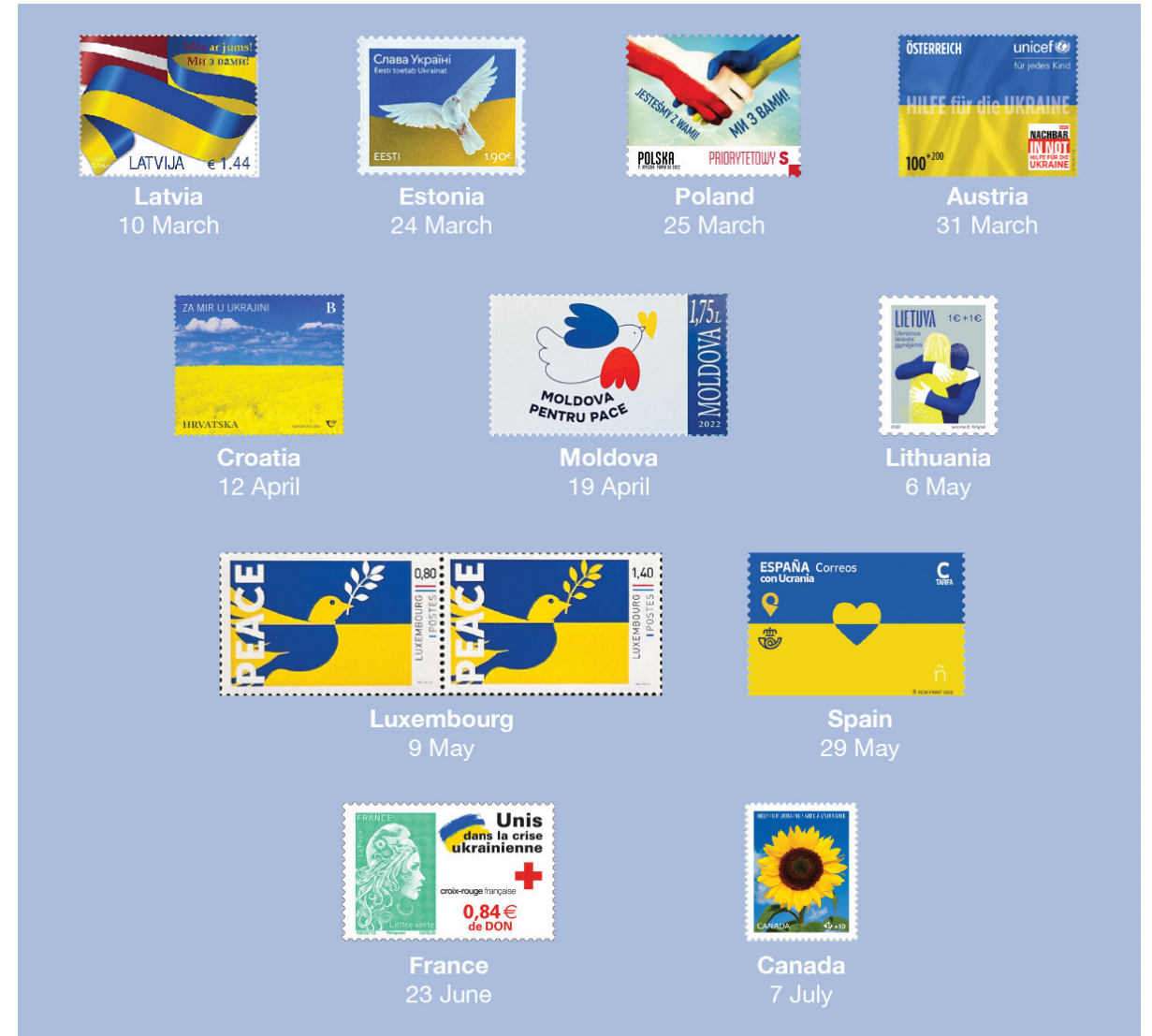
Ukraine support stamps issued by the 11 countries before mid-August 2022.

produced all my postcards – to produce my blue/yellow postcards. Second, I acquired these Ukraine support stamps to be paired with my cards. Third, I mailed these cards to the rest of the world and asked participants to show their solidarity with Ukraine by going to a local post office in their countries on the 24th of August – Ukraine's national day – to ask for a postmark on these cards. This way, the visual of the card, the stamp, and the postmark are all related to the same theme – Ukraine.