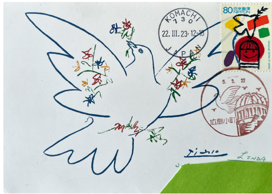
A Japanese maxicard about peace.

ible item that's beloved by stamp collectors and history buffs alike. For instance, one can place a stamp of the Atomic Bomb Dome in Hiroshima, Japan, on a postcard showing this building, then get a postmark of Hiroshima on the 6th of August – the day of the first deployment of an atomic bomb in human history. This way, the concordance between three philatelic elements – the postcard, the stamp, and the postmark – is maximised, hence the name maximum card .