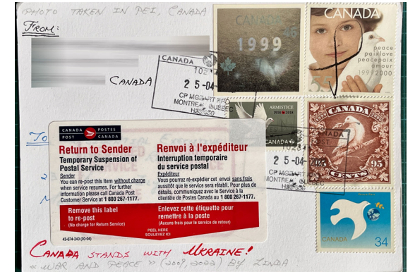
War and Peace postcard sent by Linda to the Kremlin using peace-themed stamps

A maximum card (or maxicard for short) is a postcard which features a stamp and a postmark placed on the image side of the card that are related to the same theme, creating a visually stunning and highly collect-