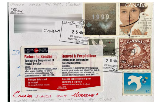
War and Peace postcard sent by Linda to the Kremlin using peace-themed stamps.

Up until then, all these efforts sound like a grassroots Mail Art initiative created out of growing political concerns. However, with my philatelic friends on The Stamp Forum , who couldn't just watch what was happening in Europe, I felt the strong urge to do something productive to help the Ukrainians to battle the uncertainty of the war. That's why I started pondering seriously over the possibility of creating philatelically worthy and historically significant maximum cards that can be auctioned off to raise funds for Ukraine relief effort.