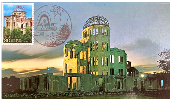
A maxicard of A-Bombed Dome in Hiroshima, Japan.

can place a stamp of the Atomic Bomb Dome in Hiroshima, Japan, on a postcard showing this building, then get a postmark of Hiroshima on the 6th of August – the day of the first deployment of an atomic bomb in human history. This way, the concordance between three philatelic elements – the postcard, the stamp, and the postmark – is maximised, hence the name maximum card .