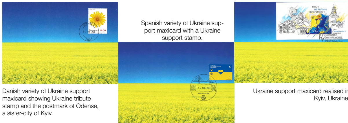
Danish variety of Ukraine support maxicard showing Ukraine tribute stamp and the postmark of Odense, a sister-city of Kyiv.